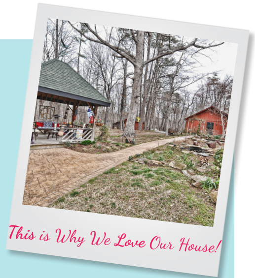
This is Why We Love Our House!

Why do we love this home so much, my first thought was, one page would not be enough! This property has quite a history...starting with the area's largest underground liquor still which ran a mile underground, right in front of this house! The story is on display at the nearby Reed Gold Mine Museum. (Yes you can still pan for gold there - fun!)